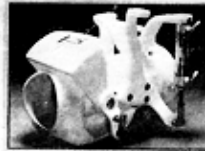
UP-DOWN NOZZLE with BUILT-IN SIDE PLATE — Patent Pending