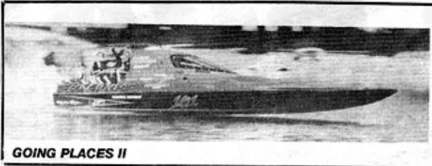
GOING PLACES II

MORE CONTROL AND PERFORMANCE FROM EVERY JET BOAT, FROM FAMILY BOWRIDER TO TOP FUEL JET